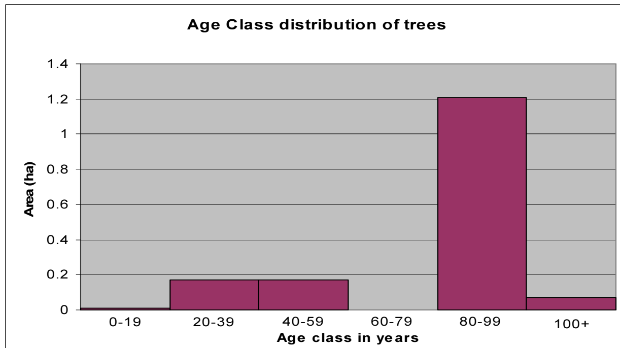
Table 3.1(b) Age class distribution of trees throughout the woodland

Be-beech, syc - sycamore, swc - sweet chestnut, sok - Sessile oak